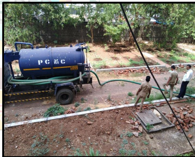
liquid Waste from tank