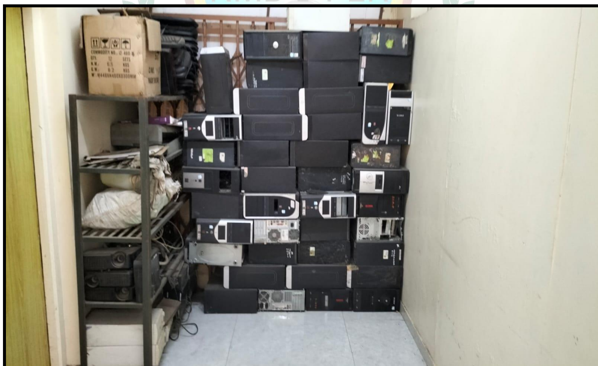
Management office E-waste collected for repair, reuse, recycling and disposable process